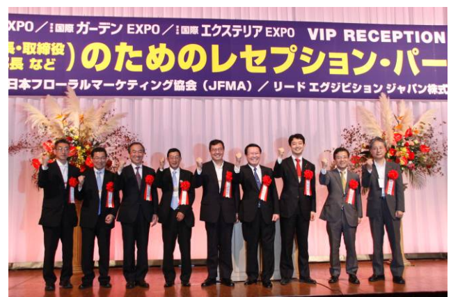
Top executives attended opening ceremony and VIP reception party to celebrate the fair