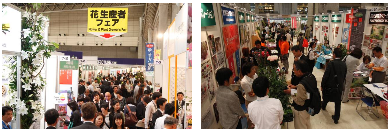
Flower/Plant Growers' Fair was a popular spot for visitors.

Then, the number of flower/plant growers who exhibited in IFEX increased drastically (250% compared to last year!). The newly set up Flower & Plant Growers' Fair proved to be a popular spot for visitors. Many small growers from all over Japan took advantage of the mini stand package which provided a small but effective space for them to introduce their produce to interested parties. Meanwhile, most of the growers from overseas exhibited in their country pavilions that included Colombia, Ecuador, Ethiopia, Taiwan, Korea, Thailand, and China. As in previous years, many of these exhibitors reported great results. The response was so good that next year the Growers' Fair is anticipated to attract 1,000 growers to participate.